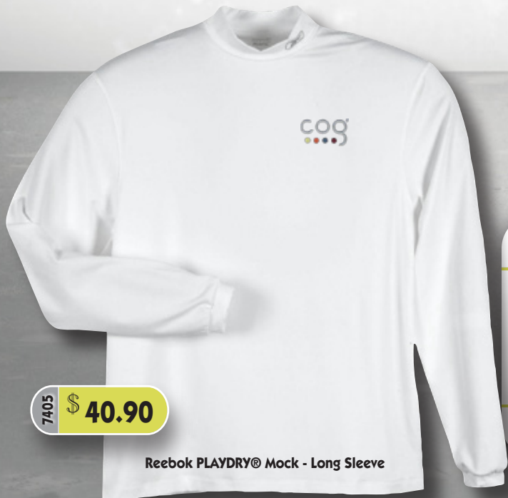
Reebok PLAYDRY® Mock - Long Sleeve