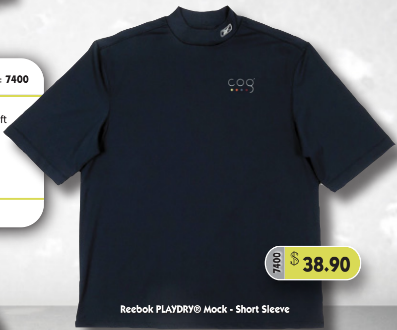
Reebok PLAYDRY® Mock - Short Sleeve