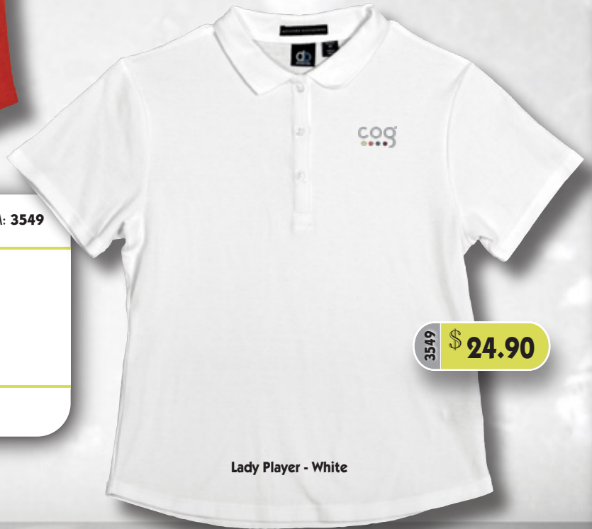
Lady Player - White