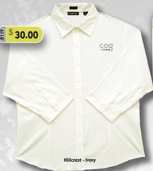
Hillcrest - Ivory