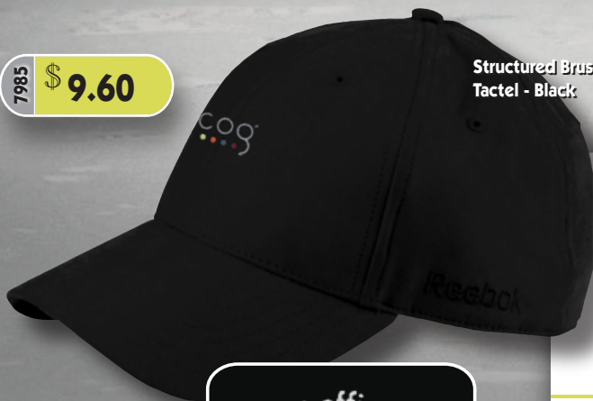
Structured Brushed Tactel - Black