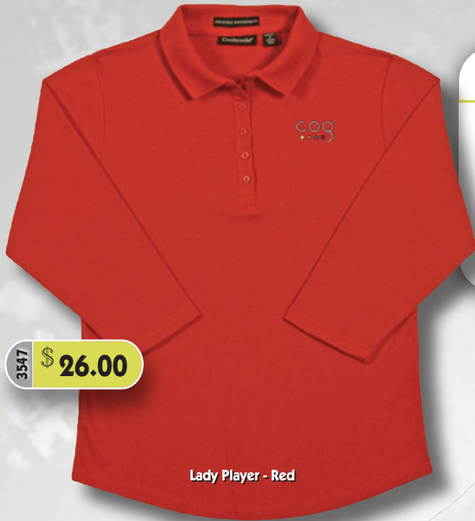
Lady Player - Red